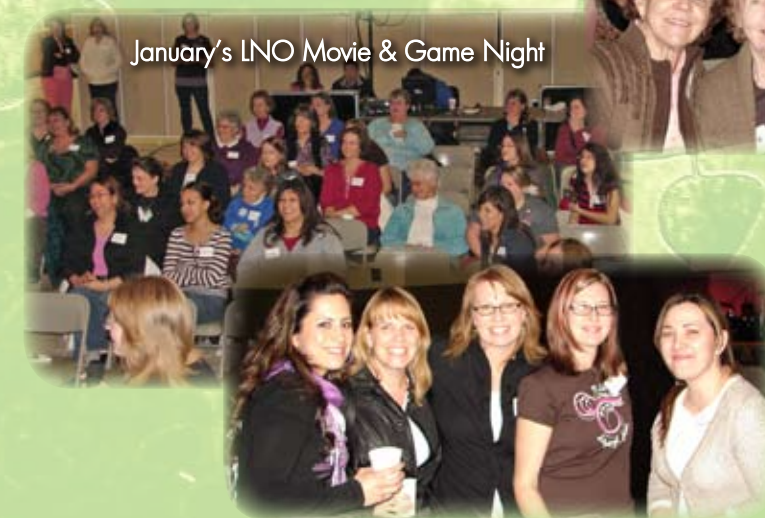
January's LNO Movie & Game Night