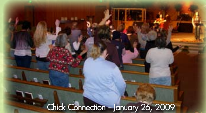
Chick Connection - January 26, 2009

parents, and single moms; I have been all of these in my lifetime. I see how God has placed me and blessed me with talents for working with children and parents and for teaching and training. I am God's vessel; use me, Lord, where you need me. Place me where others can draw closer to you. I am serving in your will so that I can grow and glorify you. Love you, Lord, with all my heart!